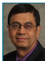
Ajay Banga Mercer University